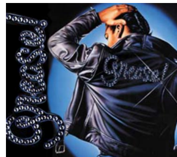
Teen Pregnancy Gang Violence Class Consciousness