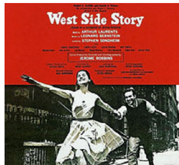
Hope and Love in A Ghetto